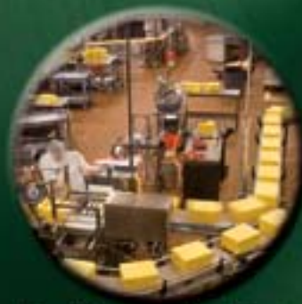
Food Processing Plants