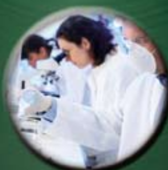
Laboratories and Research Facilities