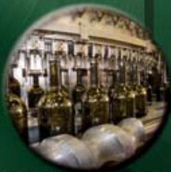
Wineries and Breweries

For more information or to order literature for Josam Stainless Steel Drainage products please contact your local Josam representative, Josam directly or visit our website at www.josam.com/literature/request