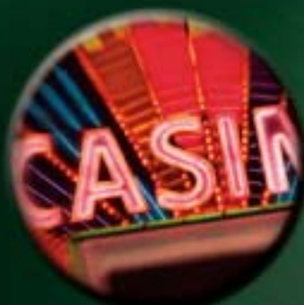
Casinos Kitchens / Bars