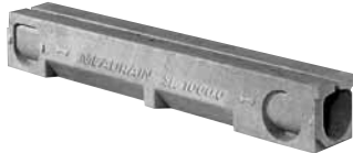
Channel units without fall

Clear width: 4" interior Total Width: 5.3" Slot width: 0.6" Fall Options: Available without fall Load Class: A, B, C