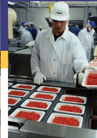
FOOD PROCESSING PLANTS