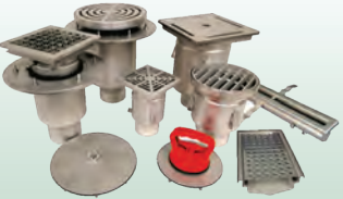
Stainless Steel Drainage Products