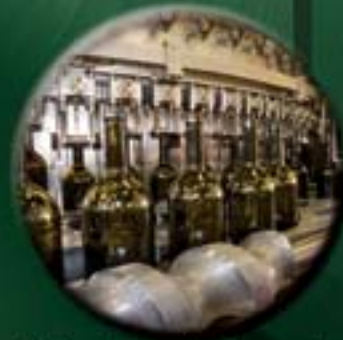
Wineries and Breweries

For more information or to order literature for Josam Stainless Steel Drainage products please contact your local Josam representative, Josam directly or visit our website at www.josam.com/literature/request