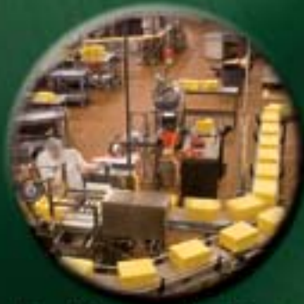
Food Processing Plants