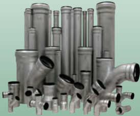
Push-Fit Stainless Steel Pipes & Fittings