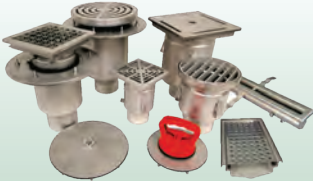
Stainless Steel Drainage Products