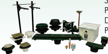
Specification Plumbing Drainage Products